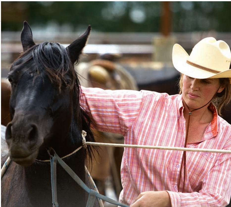
Learn to start a colt properly, develop a new horseback skill or improve your riding during one of many horsemanship-themed getaways hosted by top trainers and clinicians.