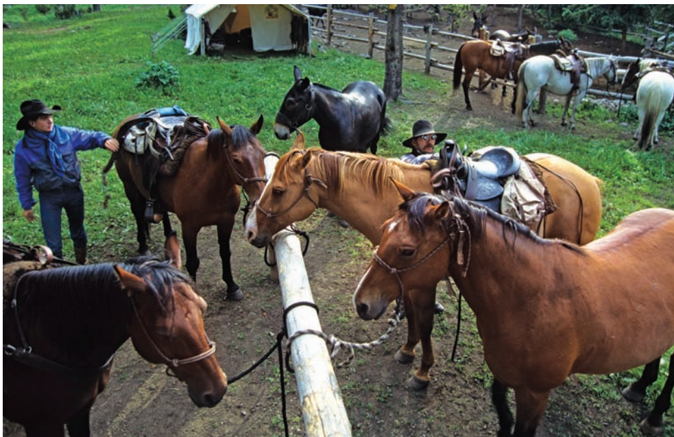
Montana wranglers prep their stock for the day’s ride. Affordable opportunities abound for outfitted trips throughout North America. Outfitters can provide saddle and pack stock, as well as equipment and experienced guides.